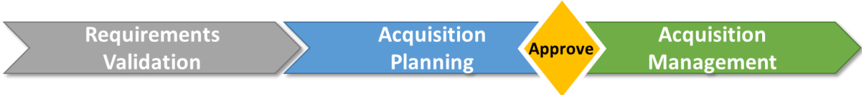
Figure 1: Framework for Organizing DoDI 5000.82 Guidance

There are six acquisition pathways under the Adaptive Acquisition Framework. Generally, all pathways consist of the following activities: requirements validation, acquisition planning, approval, and acquisition management (Figure 1). This guidebook uses the construct in Figure 1 to organize information. It provides guidance in the order of recommended execution. For example, initial Clinger Cohen Act compliance criteria may occur during requirements validation with remaining criteria addressed during acquisition planning. Guidance in this section applies to all acquisition pathways. A table is included at the end of this section to address activities where unique pathway guidance exists.