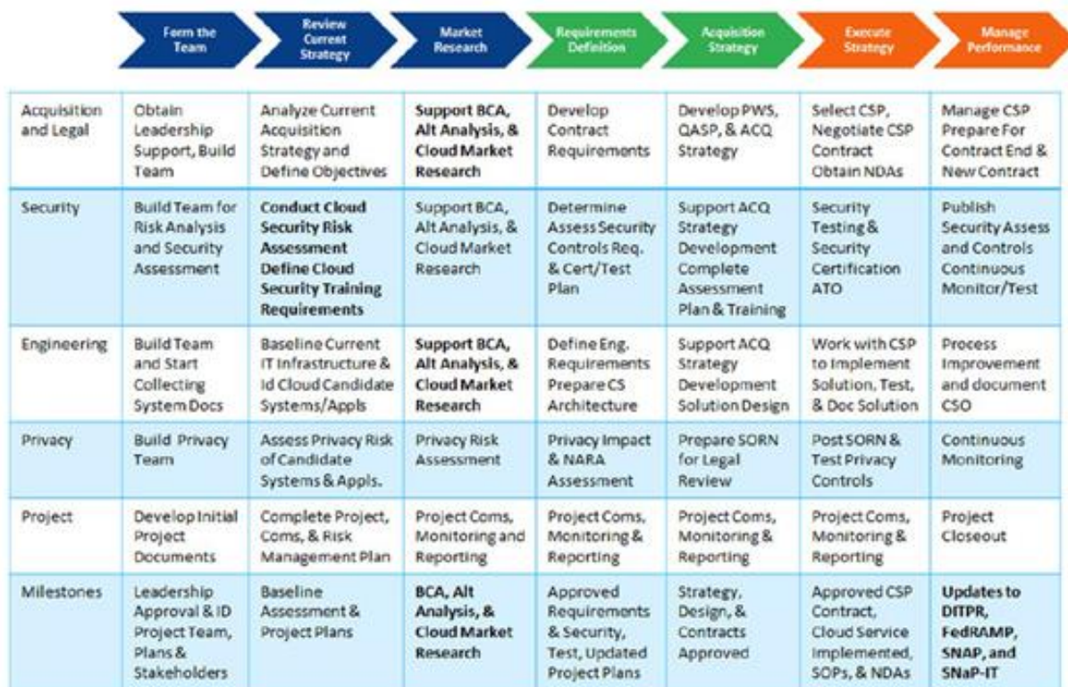
Figure 2: Services Pathway for Cloud Services

Many cloud services requirements can be and should be acquired using the acquisition of services pathway per DoDI 5000.74. Cloud service considerations for each step in the services pathway is described in Figure 2.