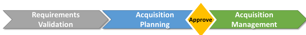
Figure 1: Framework for Organizing DoDI 5000.82 Guidance

There are six acquisition pathways under the Adaptive Acquisition Framework. Generally, all pathways consist of the following activities: requirements validation, acquisition planning, approval, and acquisition management (Figure 1). This guidebook uses the construct in Figure 1 to organize information. It provides guidance in the order of recommended execution. For example, initial Clinger Cohen Act compliance criteria may occur during requirements validation with remaining criteria addressed during acquisition planning. Guidance in this section applies to all acquisition pathways. A table is included at the end of this section to address activities where unique pathway guidance exists.